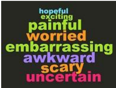
Image where the most common word is largest.