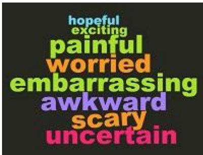
Image where the most common word is largest.